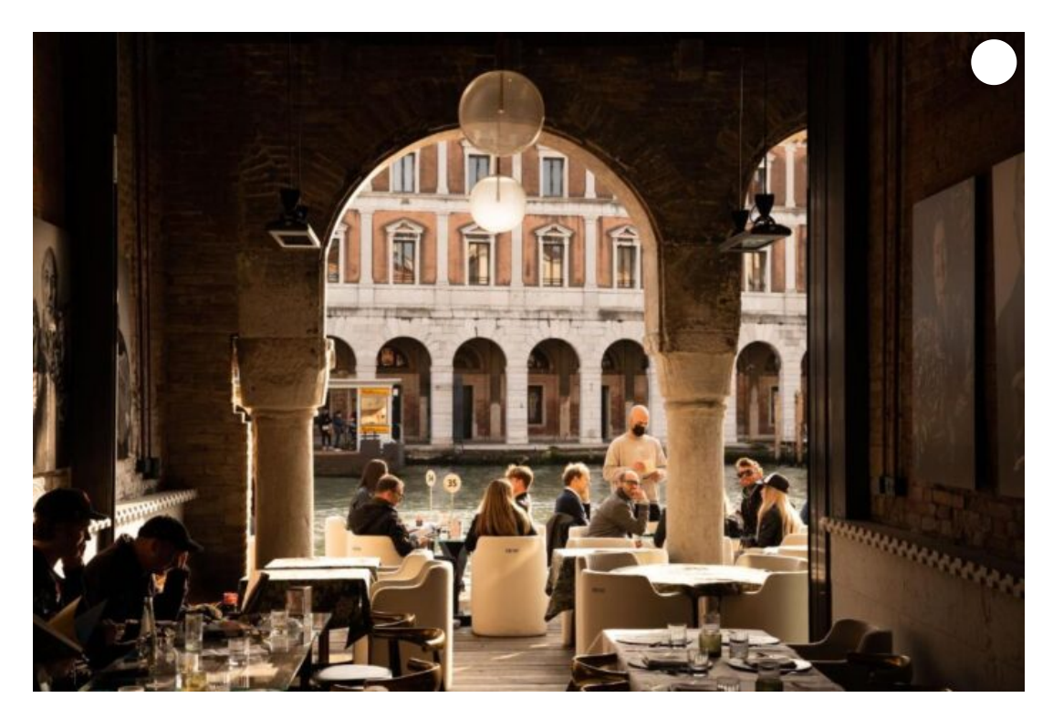
Female solo travel is no longer just a niche trend; it's a movement.

Women, are embracing the freedom of exploring the world on their own pace. This shift is due to growing confidence, enhanced safety measures, and the rise of digital nomadism, which has redefined work-life flexibility.