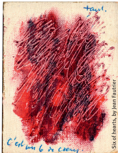
Six of hearts, by Jean Fautrier